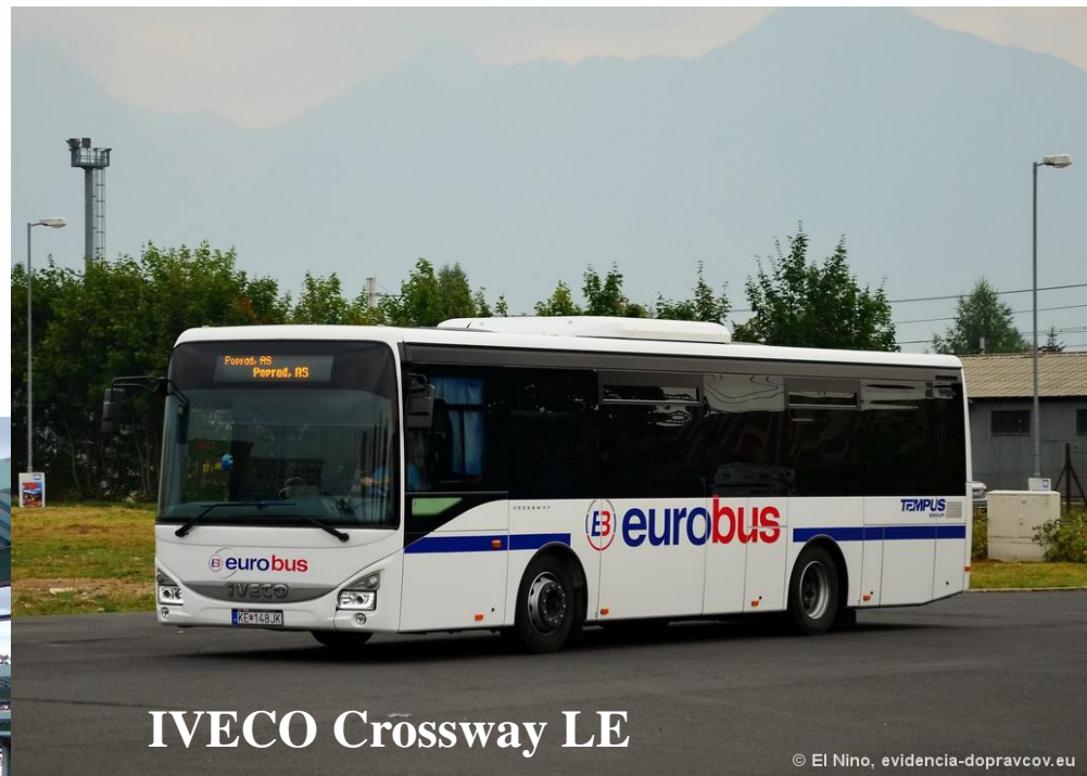
IVECO Crossway LE